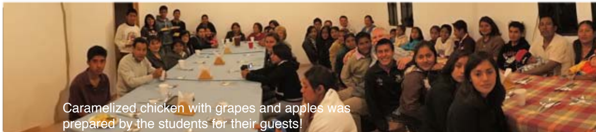
Caramelized chicken with grapes and apples was prepared by the students for their guests!