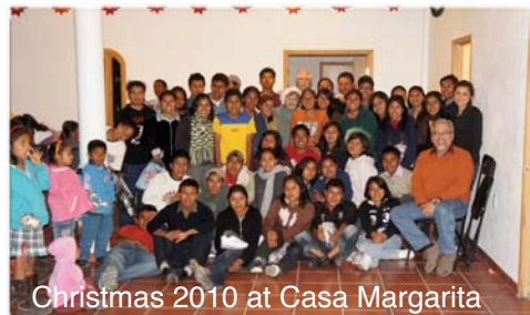
Christmas 2010 at Casa Margarita

This year we don't have many resources but we decided to move on and bring 23 kids from Oaxaca to Mexico City. Their trip was very much deserved.