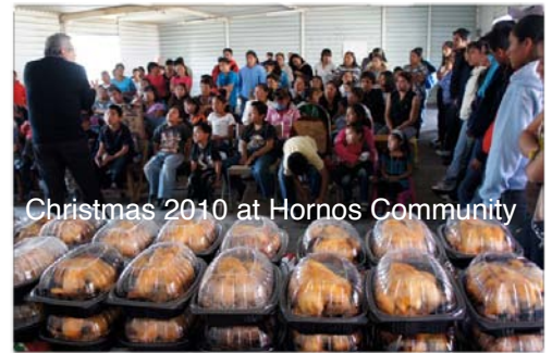
Christmas 2010 at Hornos Community