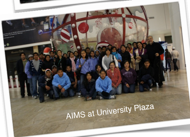
AIMS at University Plaza