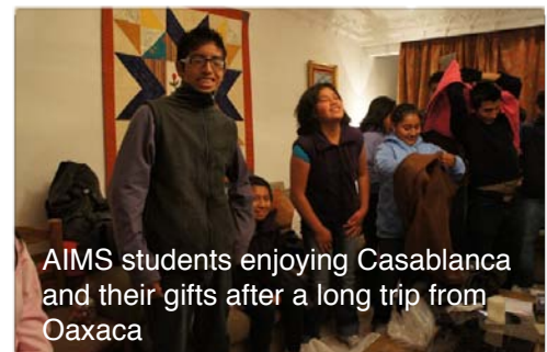
AIMS students enjoying Casablanca and their gifts after a long trip from Oaxaca

Christians trying to be a light in the darkness. This year the people of Jalalpa had a very special gift