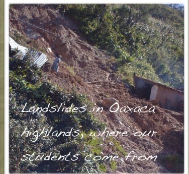
Landslides in Oaxaca highlands, where our students come from

THANK YOU, LORD. THANK YOU, BROTHERS & SISTERS