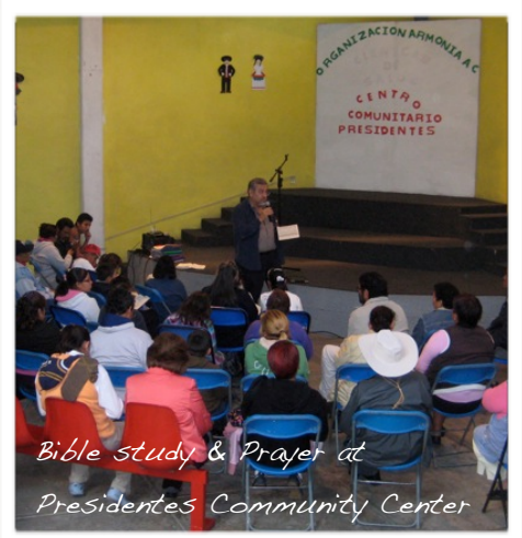
Bible study & Prayer at Presidentes Community Center