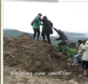
Helping one another